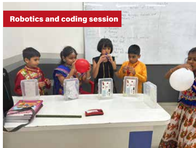
Robotics and coding session