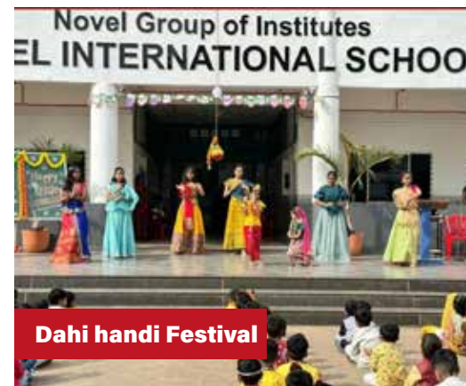
Dahi handi Festival