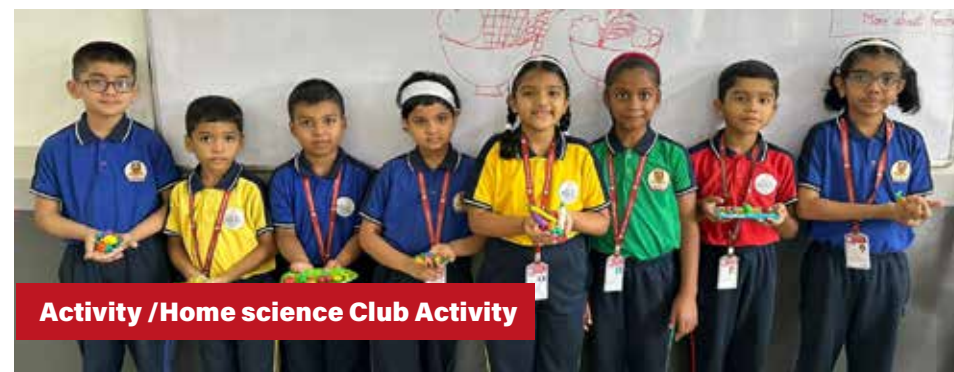
Activity /Home science Club Activity