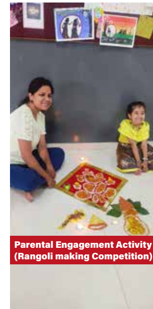
Parental Engagement Activity (Rangoli making Competition)